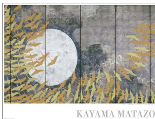
“A Thousand Cranes”: 1970 – The National Museum of Modern Art,