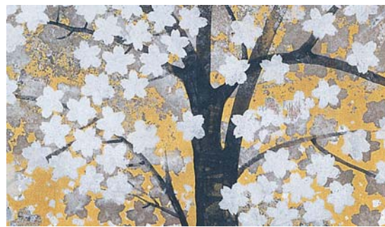
The details of “Waves in Spring and Autumn” as presented with Blu-ray’s clear images